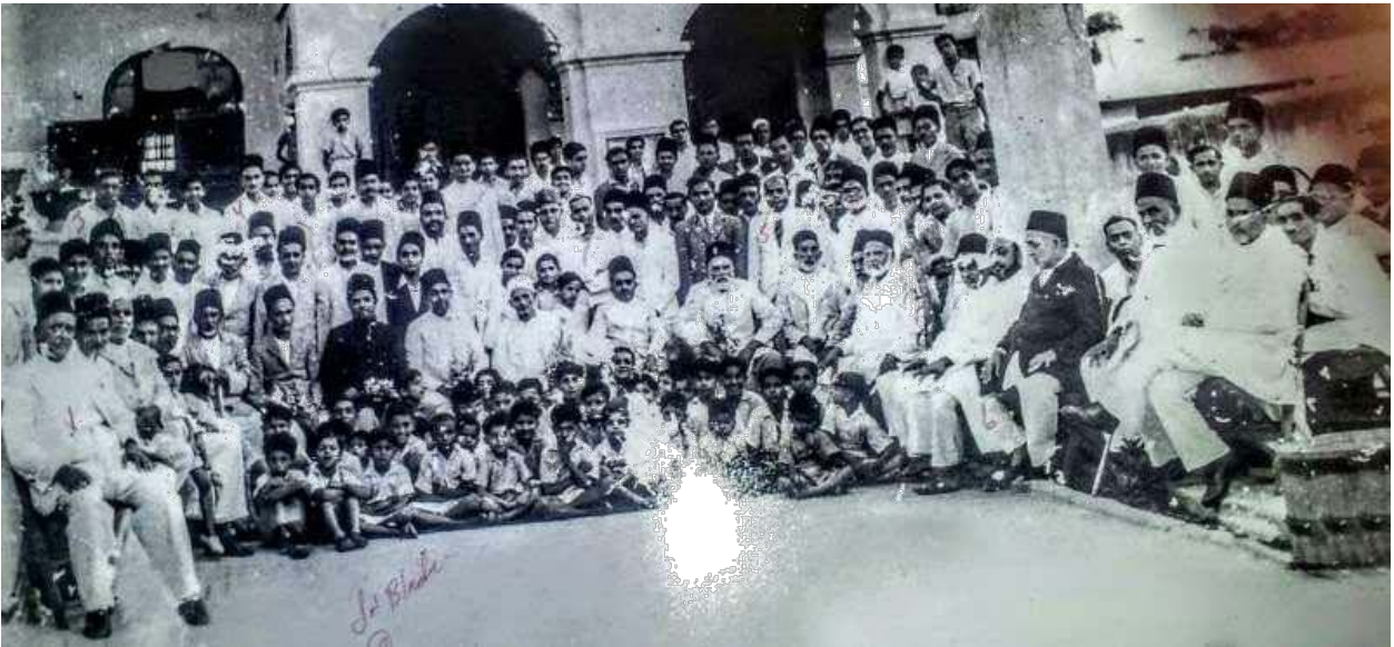
Above: Official Opening of the Dar es Salaam Imambara in 1944. Jamaat and Community elders and children are seen here seated for a group photograph of this historical moment of the Jamaat.