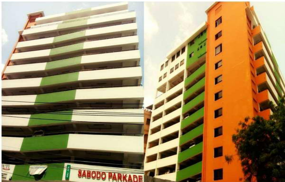
Above: The Sabodo Parkade on India Street

A new addition to the complex is the 300 cars parking lot Sabodo Parkade which was constructed between 2011 – 2015, is a ten story building on the other side of the complex facing India Street. The Jamaat offices, modern kitchen, Ghusalkhana are also housed in this Building.