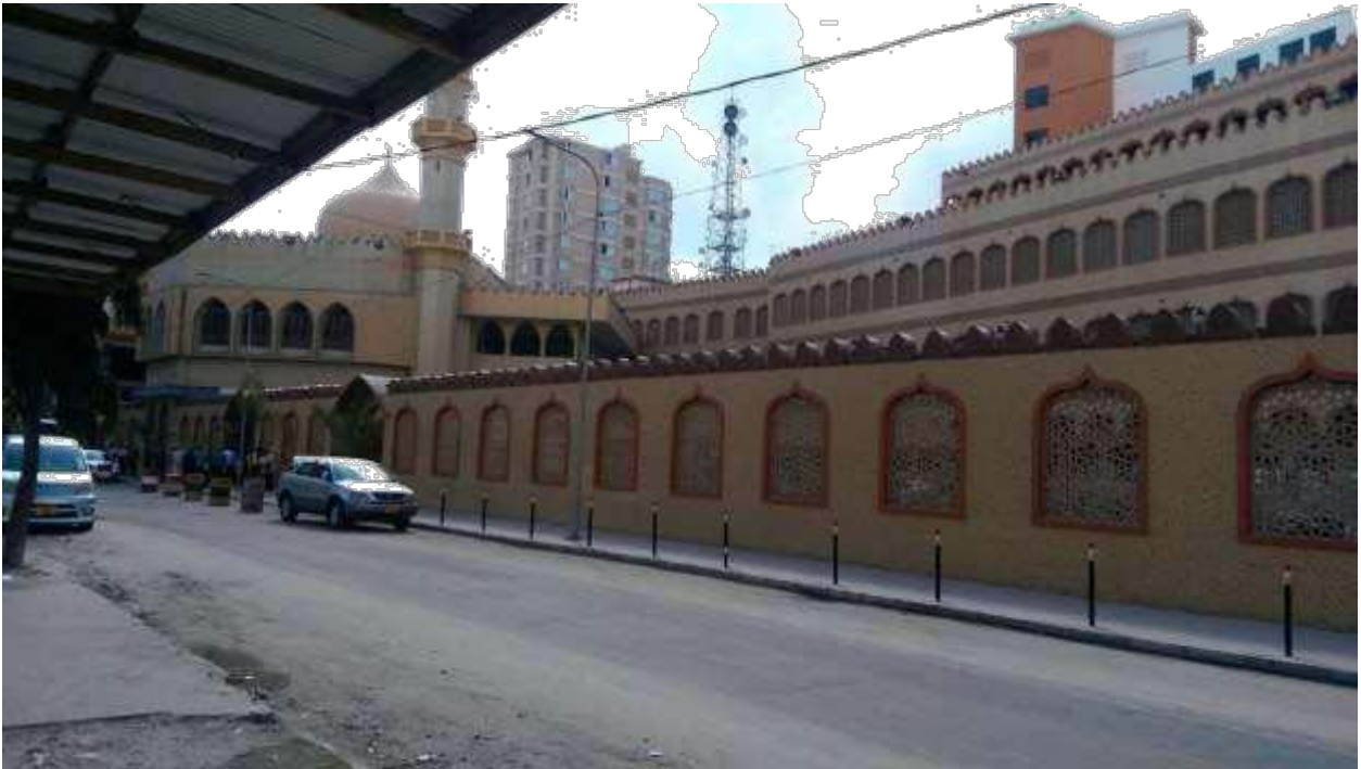
Above: The magnificent Mosque and Imambara complex front area on Indira Gandhi Street. The new arch designed fencing as seen here was recently completed with a new walkway all along the complex up to Musafarkhana which is on the corner of Indira Gandhi and Zanaki Street, next to the Mosque.

A new addition to the complex is the 300 cars parking lot Sabodo Parkade which was constructed between 2011 – 2015, is a ten story building on the other side of the complex facing India Street. The Jamaat offices, modern kitchen, Ghusalkhana are also housed in this Building.