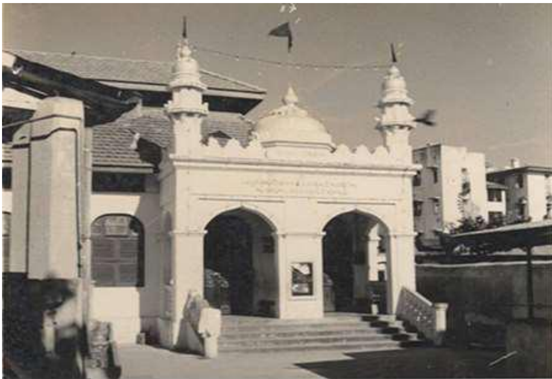
Above: The renovated Imambara featuring beautiful dome with two small minarets commemorating 1300th year of tragedy of Kerbala was built in 1942 at the entrance of the Imambara in the gents' section.