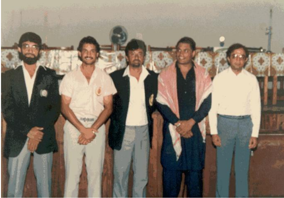
Captains of the participating clubs in the TAGT tournament held in Daressalaam in December 1986.