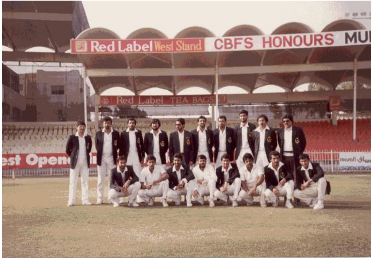
Group photograph of Union S.C. in Sharjah Stadium in 1989.