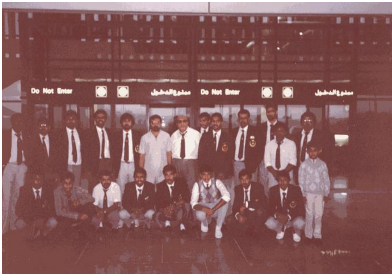
Union S.C squad arrival at Dubai Airport 1989.

Beside local tournaments in Daresalaam and within Tanzania the club had opportunity to tour outside Tanzania for friendly encounters on invitations by clubs from Dubai, South Africa, India and U.K. First ever cricket club from Tanzania to travel out-side Africa. In 1989 the club travelled to Dubai for different games cricket, volleyball, squash and tennis also in 1991. In 1992 the club was invited and travelled to Johannesburg South Africa. And the same year the club toured to Mumbai India for friendly encounter. In 1996 the club toured to UK for series of friendly cricket matches in London, Essex, Yorkshire and Southampton.