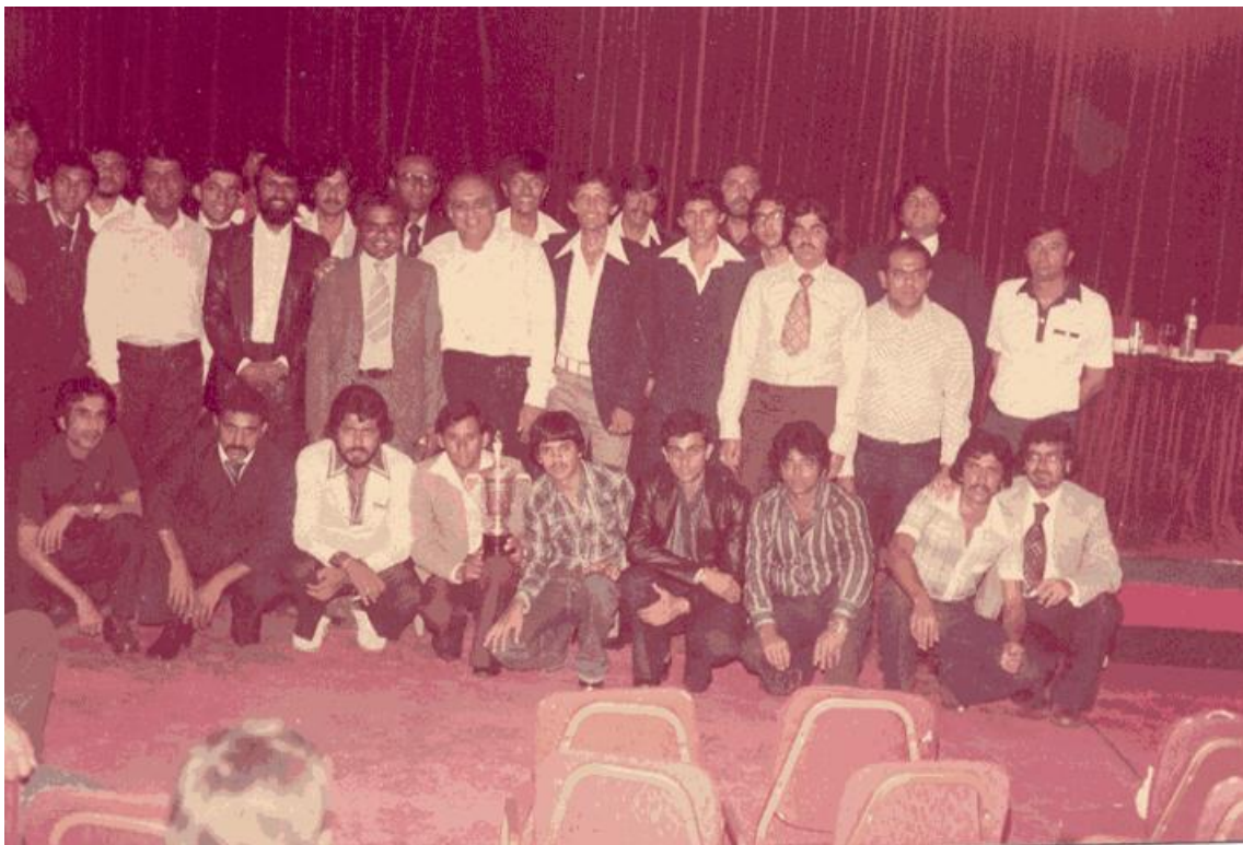
Group photograph: Union S.C. players/officials with their host Universal S.C. of Harare players/officials during the closing ceremony of TAGT tournament in Harare in 1981.

The mammoth size of the contingent (17 members) per club travelling was hosted with full accommodation borne on reciprocal basis by the host country.