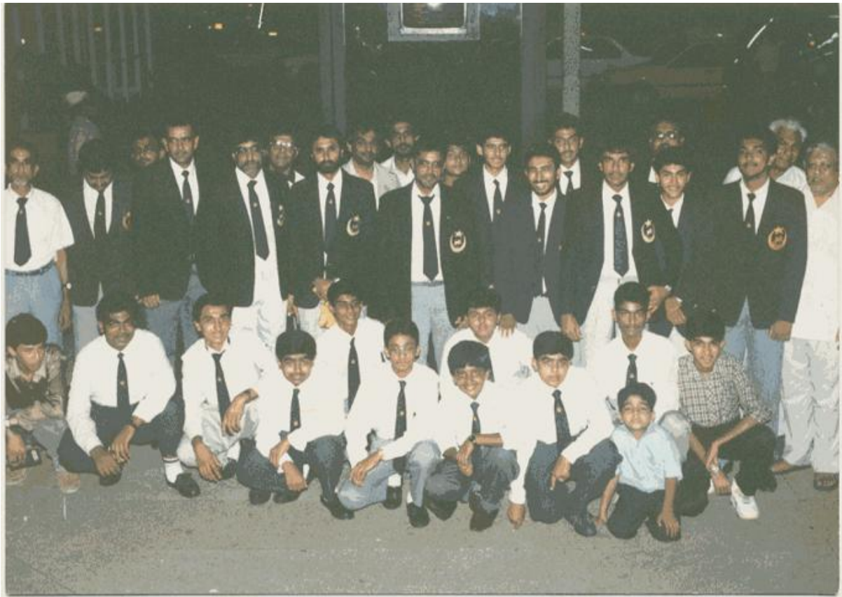
Union S.C. squad of cricket players and supporters about to leave for Mumbai to play series of cricket matches at the invitation of various clubs from Mumbai in 1992.