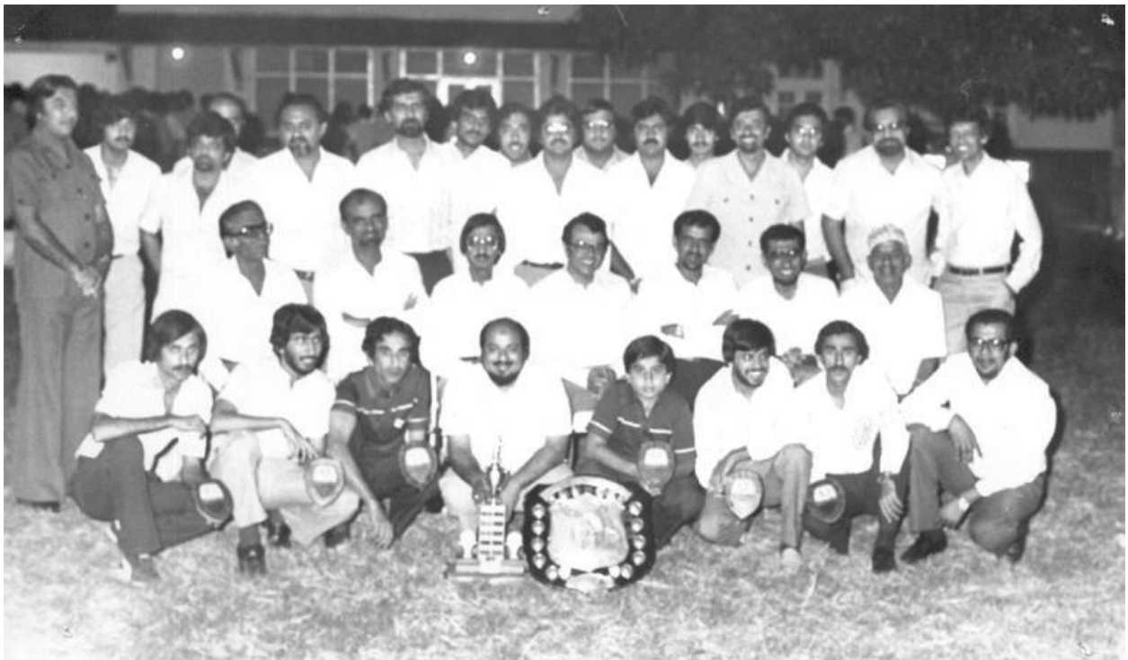
1984 - Once again Union S. C. winning all trophies of competitions organized by DSM Cricket Association.

Players, officials and fans pose photographs with the trophies.