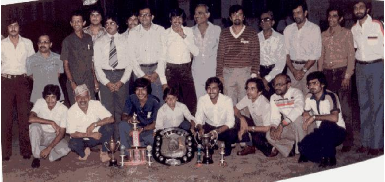
1981 - Union Sports Club won all 4 trophies of competitions organized by DSM Cricket Association. Players, officials and fans pose picture with the trophies.