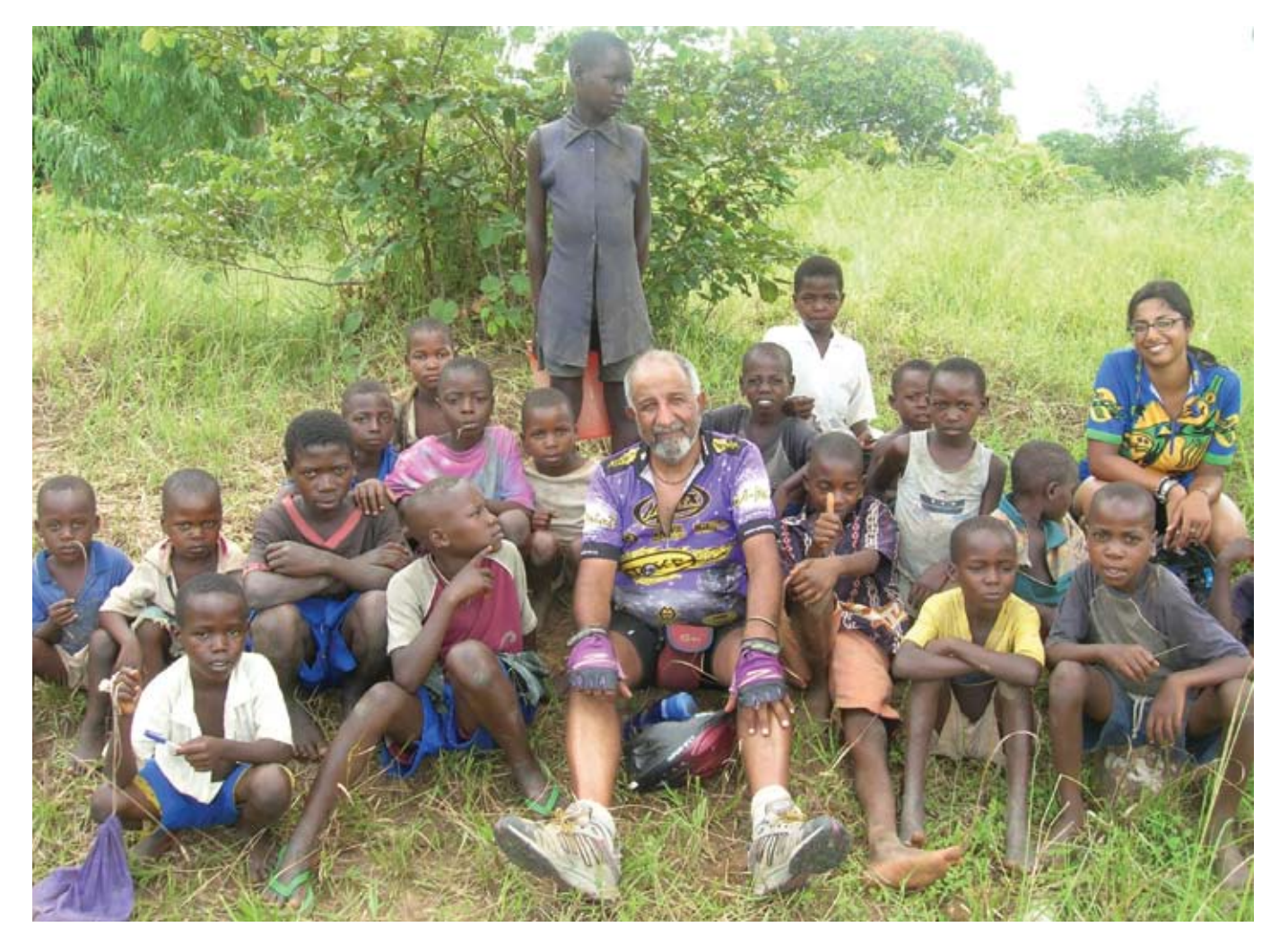
Sitting with children along the road in Malawi.

through us at the same time. About 20 km before we crossed the finish line, we had our last moments together as a group before we were joined by media and a handful of other riders who had come to join us on our final stretch.