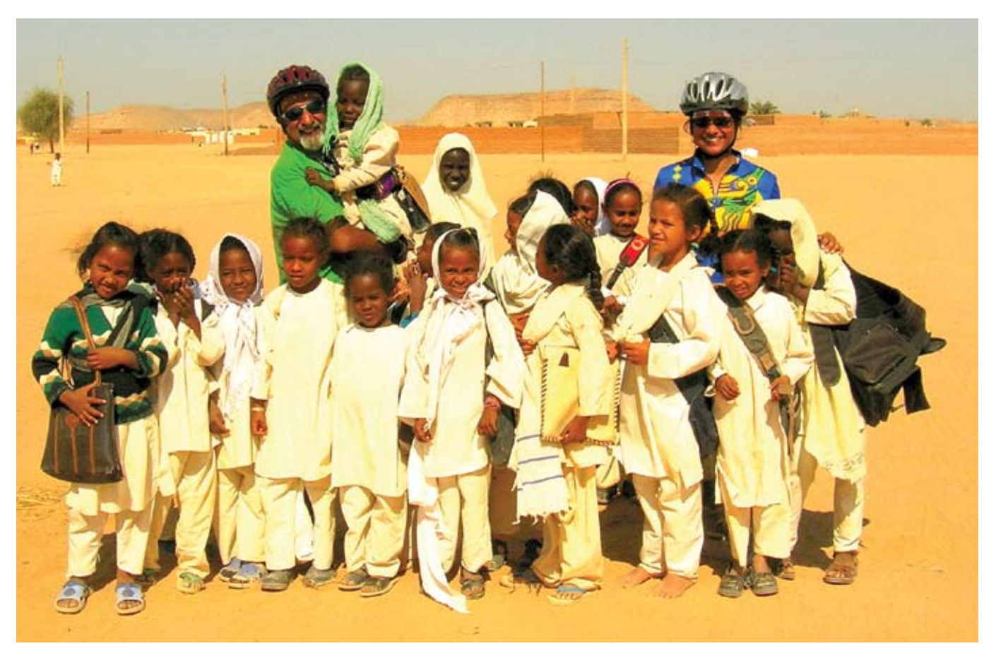
With school children in Wadi Halfa, Sudan.

get up before sunrise, pack up our tents and equipment, eat a hearty breakfast and get on the road. For me, breakfast during the first part of the Tour was horrible. I have never been able to eat porridge or oats or cream of wheat, so I would start cycling with only some energy bars or bread in my stomach. As much as I tried, I just couldn't eat the breakfasts and that really took a toll on me. The further south we went, however, the more access we had to different supermarkets and products, so the