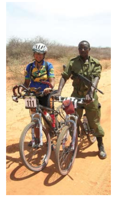
Riding with personal police escort in Northern Kenya.

Before we embarked on this journey, many people questioned our sanity but it was only upon entering Sudan that I myself began questioning the logic of our decision. As one of the least visited countries in Africa, Sudan has some of the most unforgiving terrain on the continent. Surprisingly enough, although we were constantly sore and tired from riding over bone-jarring roads and through deep sand in intense 40^{\circ} C weather, both my father and I enjoyed this country tremendously. It is without a doubt that I can say that Sudan has some of the most generous and hospitable people in the region, perhaps in the whole of Africa. There are countless stories of us, as well as other riders, being invited into the homes of strangers for tea and biscuits, or of unparalleled random acts of generosity and kindness that we experienced while in Sudan. Everywhere we went, no matter how remote,