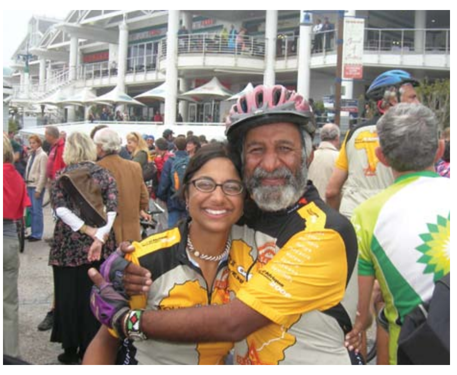
A bittersweet arrival at the finish line in Cape Town.

on what I had accomplished since writing it. I think that undertaking this exercise once again will be an excellent way for me to ensure that I don't forget the lessons I have learned and will allow me to gain some perspective about and direction for my future.