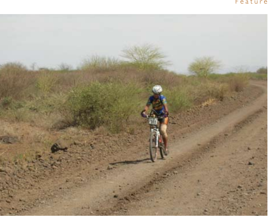
Difficult road conditions in Northern Kenya.

The weekend before I returned to Montreal from Cape Town, while we were still on the road, anxiously counting the days until we arrived at the finish line, I graduated (in absentia), along with hundreds of other students at Mount Allison University, my alma mater. I remember being in Springbok, South Africa, thinking about how I was thousands of miles away, missing the ceremony that would