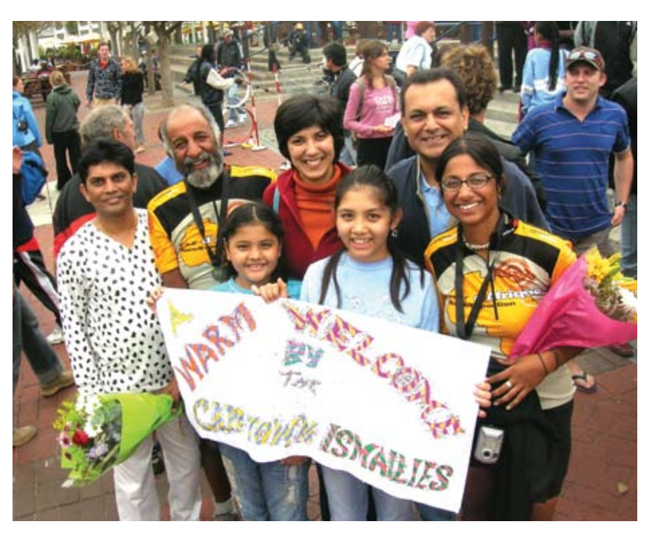
A warm welcome by the Cape Town Jamat.

As for where to go from here, I have decided to employ a technique that I learned when I participated in an Outward Bound expedition several years ago. When I finished that expedition, I wrote a letter to myself which I mailed and received six months later. In the letter, I was honest with myself about my life and about things I needed to do and change. I reminded myself about things that I had learned during the trip, I outlined my plans, goals and dreams and also warned myself about all sorts of pitfalls, especially those that I had created within my own mind, that would arise along the way. This letter was sort of a way of talking to myself in the future and receiving it was a moment to really reflect