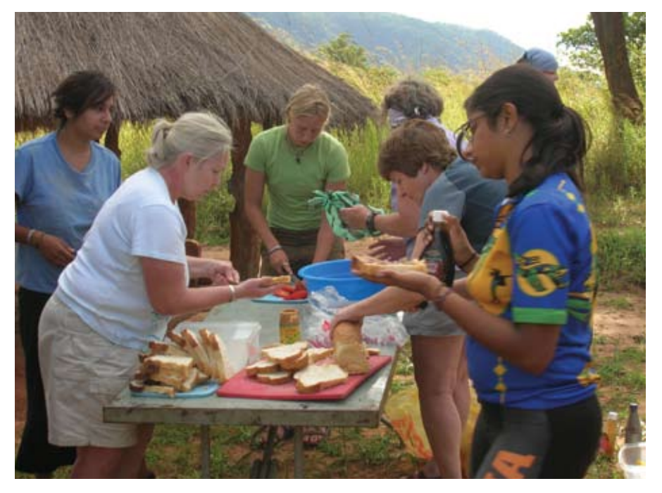
Lunch on the road

For me, the last leg was surreal. I couldn't stop smiling but I also knew that something really important was coming to an end. Finally, when it began to feel like the last 20 km couldn't be stretched out any longer, the finish line came into view. When I saw it, I actually slowed