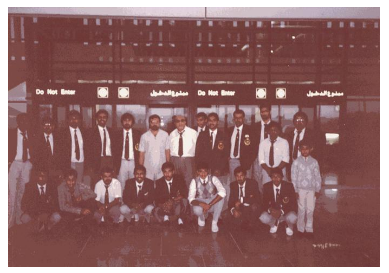
Union S.C squad arrival at Dubai Airport 1989.

Beside local tournaments in Daresalaam and within Tanzania the club had opportunity to tour outside Tanzania for friendly encounters on invitations by clubs from Dubai, South Africa, India and U.K. First ever cricket club from Tanzania to travel out-side Africa. In 1989 the club travelled to Dubai for different games cricket, volleyball, squash and tennis also in 1991. In 1992 the club was invited and travelled to Johannesburg South Africa. And the same year the club toured to Mumbai India for friendly encounter. In 1996 the club toured to UK for series of friendly cricket matches in London, Essex, Yorkshire and Southampton.