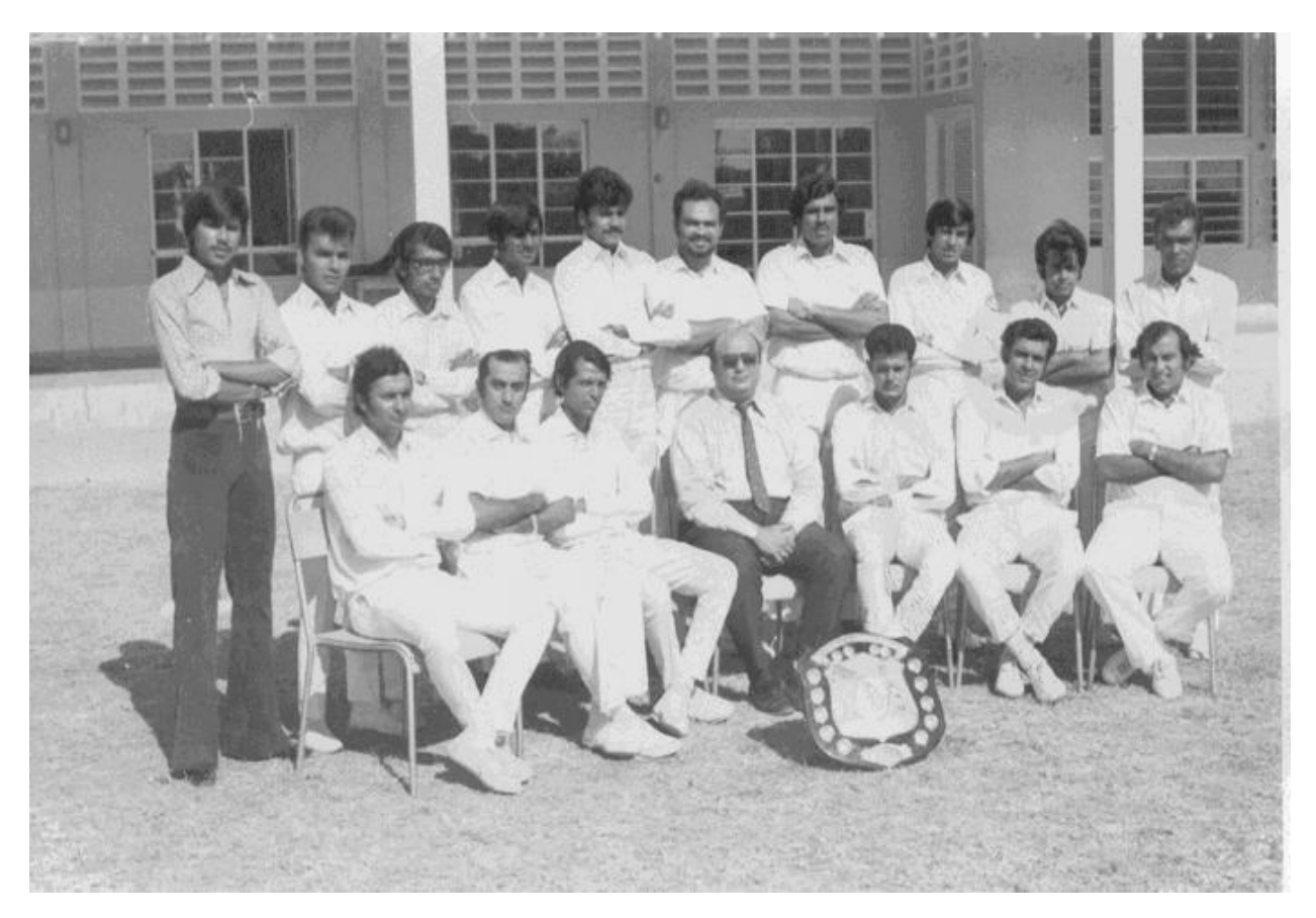
Union S.C. the Sunday League Cricket Champions after 19 yrs.

Group photograph at Coast Gymkhana in 1973.