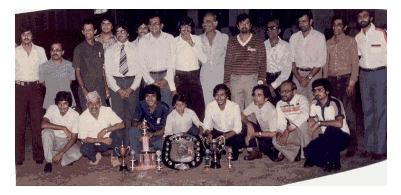
1981 - Union Sports Club won all 4 trophies of competitions organized by DSM Cricket Association. Players, officials and fans pose picture with the trophies.