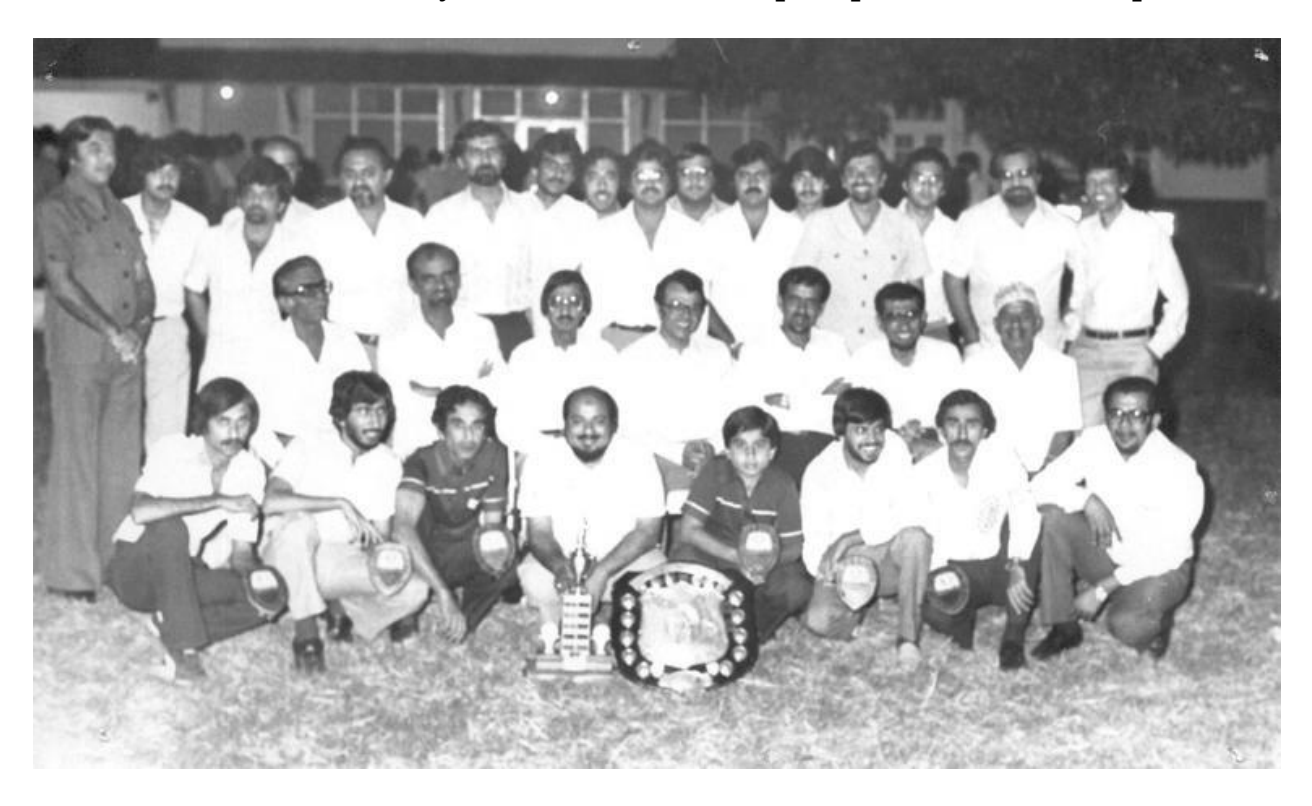
1984 - Once again Union S. C. winning all trophies of competitions organized by DSM Cricket Association.

Players, officials and fans pose photographs with the trophies.